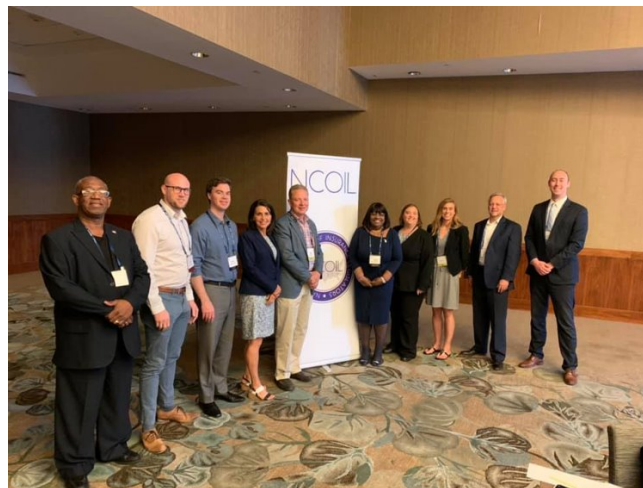
NCOIL Summer Meeting