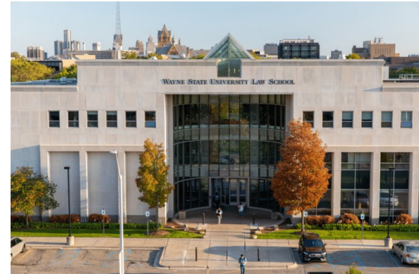
Wayne State Law School