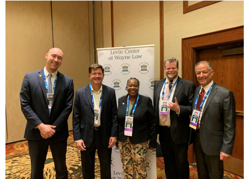
CSG West Annual Meeting