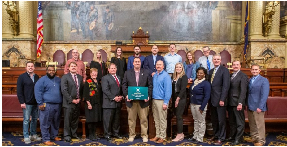
Pennsylvania Oversight Committee