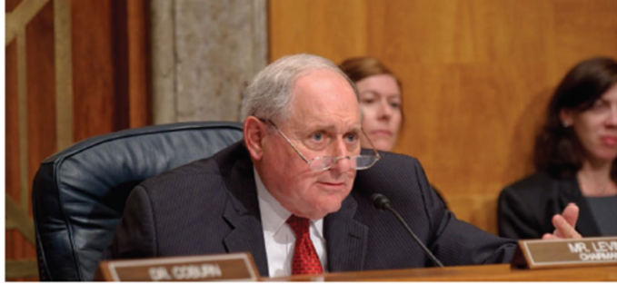
U.S. Sen. Carl Levin