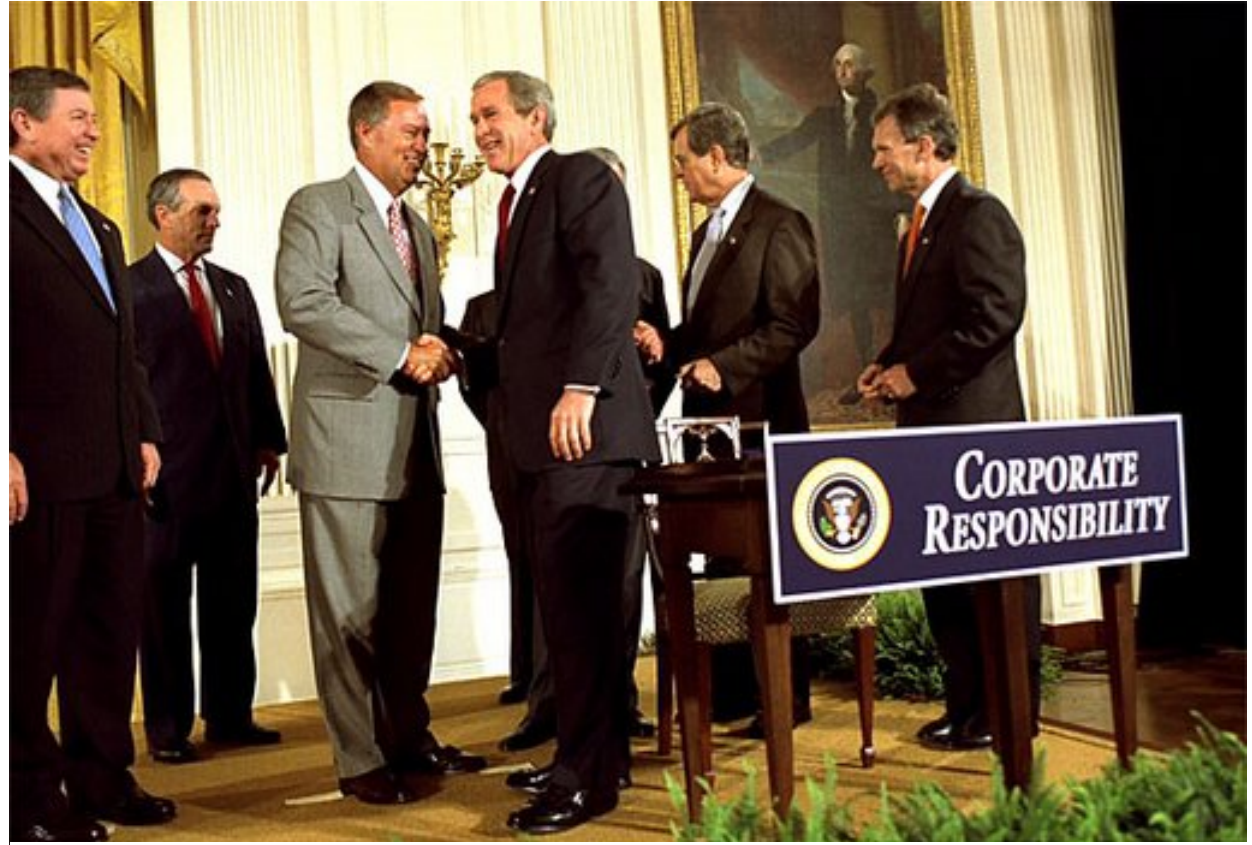
President George W. Bush shakes hands with Congressman Mike Oxley on July 30, 2002 at signing ceremony of Sarbanes-Oxley Act

In addition, after a long battle, Congress passed legislation to close what it called the "Enron loophole," a provision enacted at Enron's urging in 2000, that barred federal oversight of electronic energy trading exchanges when trading was limited to large corporations. The reasoning had been that the large firms could look out for themselves and didn't need government supervision. But Congress determined post-Enron that