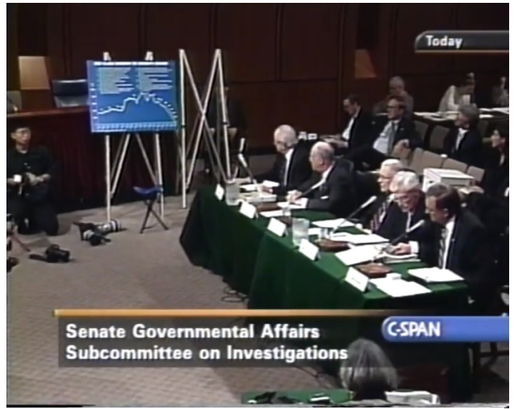
Enron's Board of Directors at hearing before the Permanent Subcommittee on Investigations

executive stock option grants, including a one-year option grant valued at $123 million for Ken Lay and a set of option grants to the head of its energy services, Lou Pai, who cashed them in and sold the underlying stock for $265 million.<sup>13</sup>