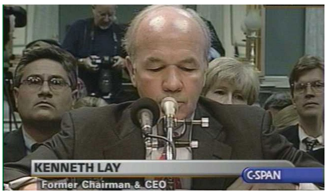
Enron founder Kenneth Lay refuses to testify before the Senate Commerce Committee